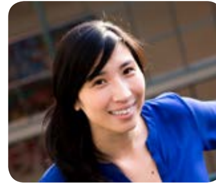
Zung Do President